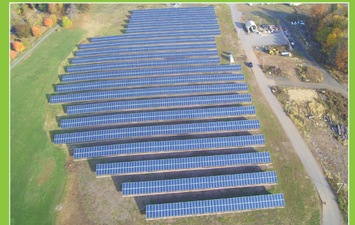
WESLEYAN UNIVERSITY MIDDLETOWN, CT 1 MW

“Greenskies continues to be our valued solar services provider. From the earliest stages of design through start-up and now into year three of operations, Greenskies continues to provide Wesleyan with the highest quality of engineering, design and operations maintenance.”