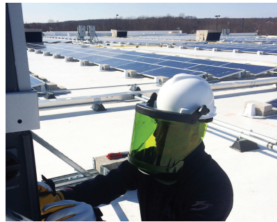
SOLAR TECHNICIAN INSPECTING ELECTRICAL WIRING